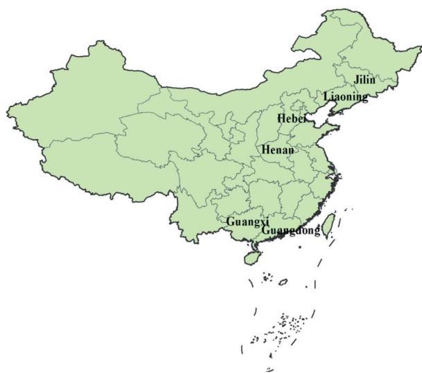
Fig. 1 The six main peanut growing provinces in China.

All solutions were prepared using ultrapure water (resistivity of 18 \text{ M}\Omega \text{ cm}^{-1} ) obtained from a Milli-Q purification system