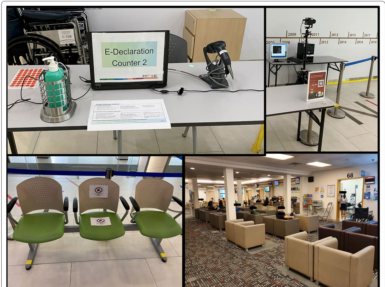
Fig. 2 An example of a pre-screening counter for COVID-19 located at the entrance of the tertiary center (top left image), a government supported digital application (top right image) is used to record the patients entry details, symptoms, previous exposure to Covid-19 and travel history (also used for contact tracing if needed), an automatic thermal scanner (top right image) to detect patients with a fever as they enter the center. Examples of signs on clinic waiting room seats used to encourage social distancing (left image) and an example of patients in the waiting room of the clinic (right image) and staff wearing surgical masks and practicing social distancing