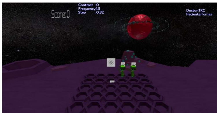
Fig. 2 Example of a VR scenario incorporated into the NEIVATECH system

have to perform 10 sessions of active vision therapy with the NEIVATECH system during the first month of treatment, 4 during the second month and 4 during the third month. On the other hand, patients assigned to group B will have to comply with 2 hours of daily patching during the 3 months of the study.