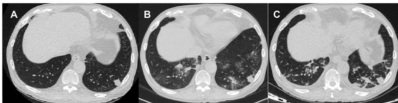
Figure 1 (A) (2019–10-18) Multiple nodules, patchy high-density shadows and glass high-density shadows were seen in both lungs. (B) (2019–10-23) Multiple nodules and patchy high-density shadows were present in both lungs. (C) (2019–10-30) Nodules and patchy shadows were seen in both lungs, and bilateral pleural effusion.