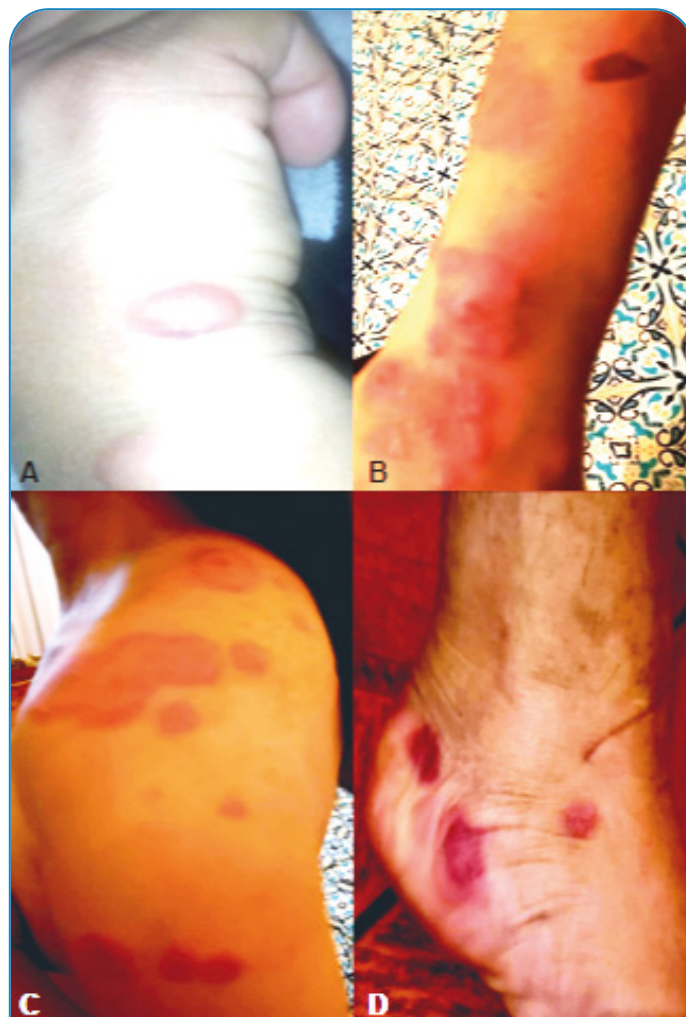
FIGURE 1: Lymphocutaneous form of sporotrichosis manifested by a previously healthy 37-year-old woman after a cat scratch. The skin lesions started at the right hand (site of trauma) as well-defined red and swollen areas, with the aspect of a pimple ( A ), and then spread to other parts of the body, including the right forearm ( B ), left shoulder ( C ), and left foot ( D ).

Oral itraconazole 100 mg/day and 180 mg/day for 60 days were prescribed with liver protector for the cat and dog, respectively. Additional precautions were recommended, such as separating these animals from others in the household and not allowing access to the street.