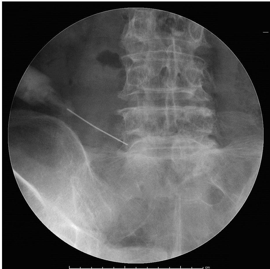
FIGURE 2: Fluoroscopic image at selective nerve root block (SNRB)