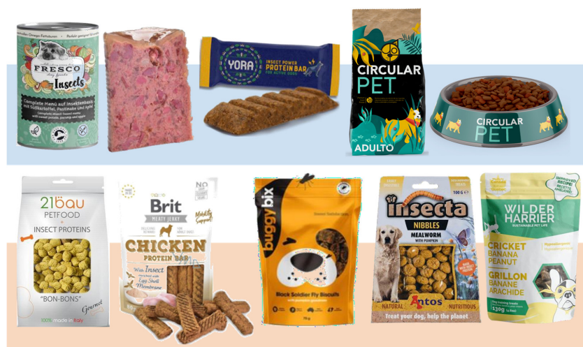
Figure 3. Examples of insect-based foods and treats for dogs and cats. Sources: Top row from left to right https://www.frescodog.co.uk/ (accessed on 26 April 2022); https://www.yorapetfoods.com/ (accessed on 26 April 2022); https://www.circular.pet/ (accessed on 26 April 2022). Bottom row from left to right https://21bites.com/ (accessed on 16 December 2021); https://brit-petfood.com/ (accessed on 26 April 2022); https://www.buggybix.com.au/ (accessed on 26 April 2022); https://www.antos.eu/ (accessed on 26 April 2022); https://www.wilderharrier.com/ (accessed on 26 April 2022).

A wide variety of dog and cat foods based on black soldier fly larvae meal, mealworms and adult crickets are available in the marketplace; of all these insects, the most commonly used are black soldier fly larvae. Some are shown in Figure 3 and the industries that produce insect meal are outlined in Table 2.