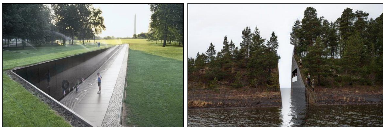
Figure 2. The Vietnam Veterans Memorial (Washington D.C., 1982) (left) and Utøya Memorial (Norway, never built) (right).

Artist and architect Maya Lin described her design for the Vietnam Veterans Memorial (VVM) (Figure 2) as being like a “cut in the earth” that creates a “wound that is closed and healing”. (The same motif of a cut in the earth was similarly used in the original design for the Utøya memorial in Norway, where 77 members of the ‘Workers Youth League’ were killed by a right-wing extremist, utilized (Figure 2).) Lin’s design is entirely horizontal and requires the visitor to descend down into it. At the same time, one memorial wall visually connects with the Washington Monument, which creates a sharp contrast of forms (see further in Section 3.10 below). Similarly, MMJE features a descending floor on which a maze of unevenly sloping stelae are placed (Figure 1). Standing on the edge of the memorial, one can look over the whole thing, but when one is inside of it, the surroundings disappear and the visitor becomes disoriented. The uneasy feeling of being down inside the memorial was the experiential core of the visit and was where our participants’ interpretations tended to be generated. Our participants only felt that their visit was completed after they had gone into the memorial, become disoriented, ascended out and then looked over the memorial again to see it in its entirety (see [28] on ‘having an experience’).