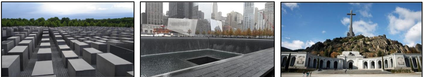
Figure 1. Memorial to the Murdered Jews of Europe (Berlin, 2005) (left), National 9/11 Memorial (NYC, 2011) (center), and Valley of the Fallen (El Escorial, 1959) (right).

At each of these sites we conducted observations of visitor's behavior on-site (7 days at MMJE, 5 days at 9/11, and 3 days at VF), short interviews with visitors to the site ( N = 45 at MMJE and 12 at VF), and more intensive data collection with a subjective camera (subcam), which records first-person video and audio ( N = 5 subcam walks at MMJE, 8 at 9/11 and 5 at VF). The three methods provide a distinctive perspective on the site. The observations provided us with a general feel for the site and an idea of what people were doing there at different times of the day, while the short interviews (10–15 min) offered access to people's varying interpretations and feelings about the site. The short interviews were done with any visitors to the site that were willing to talk with us, whereas for the subcam data-collection (which took around an hour) we recruited participants from our social network and local universities, where students were asked if they were interested in participating in research on memorial sites. Thus, the short interviews were done with a diversity of visitors to the sites (from a wide range of age groups and nationalities), whereas most participants doing the subcam task were in their 20s to 30s and from the country where the memorial was located. Triangulating the three methods did not reveal inconsistencies but allowed for different levels of breadth and depth of analysis.