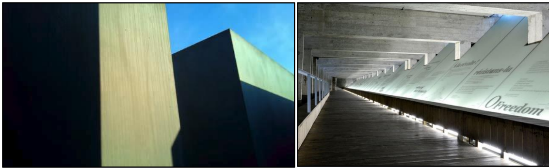
Figure 4. MMJE from the participant's (subcam) (left) perspective and Memorial to the Abolition of Slavery (Nantes) (right).

Yet, it also happened that participants sometimes oscillated between immersion and separation. This was particularly clear in our fieldwork at VF. While the youngest participants that did the walk-along interview experienced it exclusively as a cold, distant and empty (associated with fascism), a woman in her 60s also saw it in terms of something warm, beautiful and familiar (associated with a Spanish church). On entering the first hall, she comments (cold associations are in bold and warm in italics ):