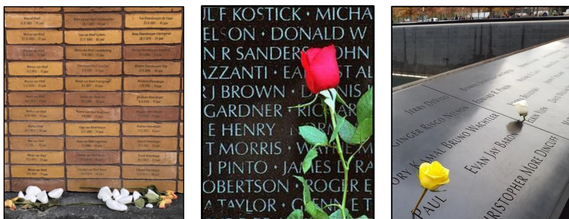
Figure 6. Individual names at the Holocaust Names Memorial (left), Vietnam Veterans Memorial (center), and 9/11 Memorial (right).

Finally, at the newly opened Holocaust Names Memorial, the 130,000 individuals from the Netherlands that died in the concentration camps are listed alphabetically, together with their birthday and age at which they died. This allows visitors to search for particular names more easily and see family connections—for example, Anne Frank and her family. Similar to what we found at 9/11, one visitor we spoke to searched for his own name at the site, and on finding it, he did historical research on who the person was and their life trajectory, discovering some parallels to his own family migration history. This is again a strategy of building a personal connection to the unique individual represented by a name. It contrasts sharply with MMJE, where visitors struggled to find a point of personal connection with the abstract site, with few indicators as to what it stands for.