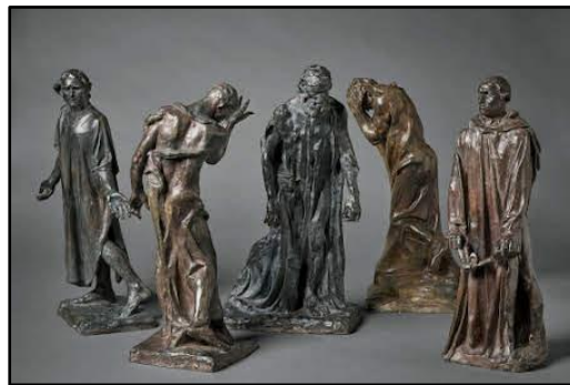
Figure 3. Rodin's Burgher of Calais (1895).