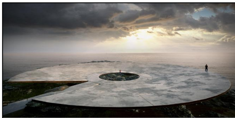
Figure 8. World Memorial to the Pandemic (planned, Montevideo).