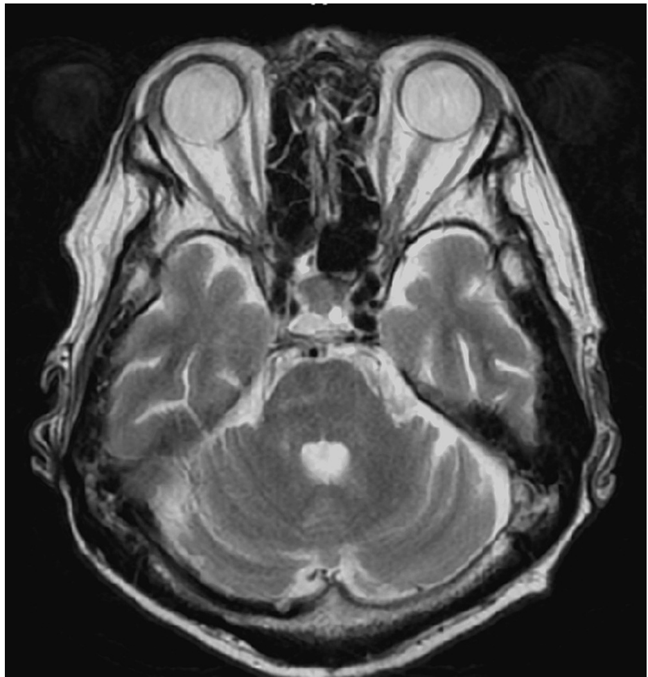
FIGURE 2: T2-weighted MRI of the head shows no abnormalities, including the optic nerve.

The anti-thyroglobulin antibody and anti-thyroid peroxidase antibody were positive, but serum testing excluded syphilis, Sjogren's syndrome, SLE, vasculitis, and paraneoplastic neurologic syndrome (Table 2). On day 10, dysuria developed, and an indwelling urethral balloon was inserted on day 16. Rectal examination revealed decreased contraction of the anal sphincter.