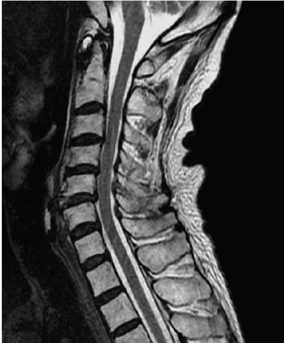
FIGURE 3: T2-weighted MRI of the neck does not show demyelination.

Steroid pulse therapy (methylprednisolone, 1,000 mg/day) was started on days 30-32, and prednisolone 50 mg/day (1 mg/kg/day) was started on day 33. After the initiation of steroid therapy, the patient no longer had a fever (Figure 1). On day 38, his MMSE score was 27 points, indicating cognitive function recovery. On day 43, the urethral balloon was removed, and the voiding function recovered. The prednisolone dosage was reduced to 45 mg/day on day 44 and 40 mg/day on day 51, but there was no relapse of symptoms. The patient was discharged on the 56th day.