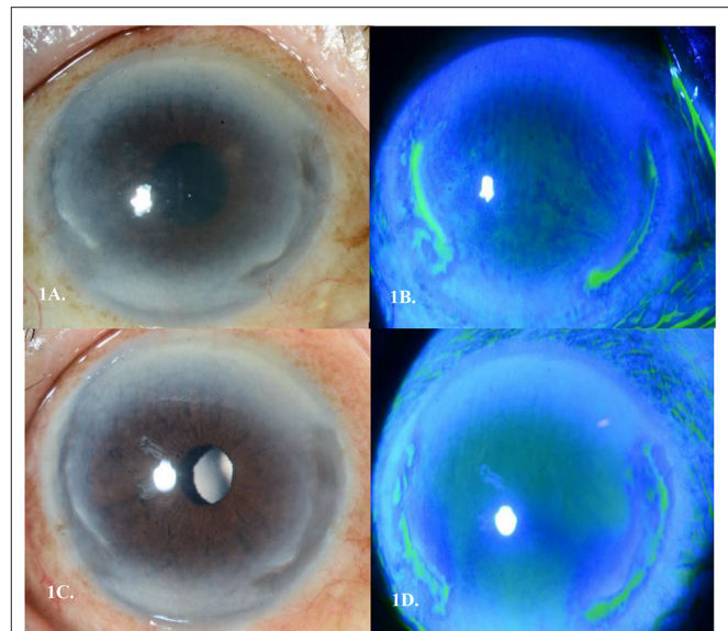
FIGURE 1 | (A) Peripheral ulcerative keratitis (PUK) seen in Case 1's right eye with 2 discrete areas of severe peripheral corneal melt spanning 2 clock hours nasally and 2 clock hours temporally (B) . Corresponding staining of areas of cornea melt temporally and nasally (C) . Epithelization over the two areas of cornea melt by day 9 of treatment (D) . Corresponding area of pooling temporally and nasally showing epithelization of the stromal melt.

His symptoms of right eye redness and ocular discomfort started ~1 month after completing his chemotherapy. On presentation, his best corrected visual acuity (BCVA) was 6/18 in the right eye. Slit lamp examination revealed mild conjunctival injection with two discrete areas of severe peripheral corneal melt spanning two clock hours nasally and two clock hours temporally with 60% thinning. There was an associated overlying epithelial defect, with Descemet membrane folds, and the presence of anterior chamber cells (grade 2). There was no scleritis ( Figures 1A,B ). Left eye and posterior segmental examination of both eyes were unremarkable. Extensive autoimmune and infective work up, including a full blood count, tuberculosis and syphilis screen, and an autoimmune serum panel (antinuclear antibody, anti-double-stranded DNA antibody, antinuclear antibody profile, ANCA-EIA profile) all returned negative. Due to progressive severe corneal thinning, the patient was then started on IV Methylprednisolone 500 mg/OM for 3 consecutive