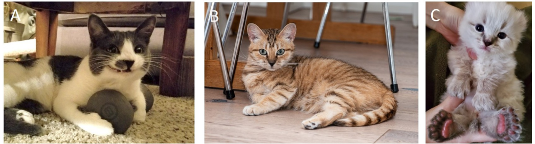
Fig 1. A) The signature “smile” of a cat with Myotonia Congenita; B) The rare coat color phenotype Amber in a random-bred cat from Finland; C) Polydactyly variant Hw also associated with extra toes in all four feet.

https://doi.org/10.1371/journal.pgen.1009804.g001