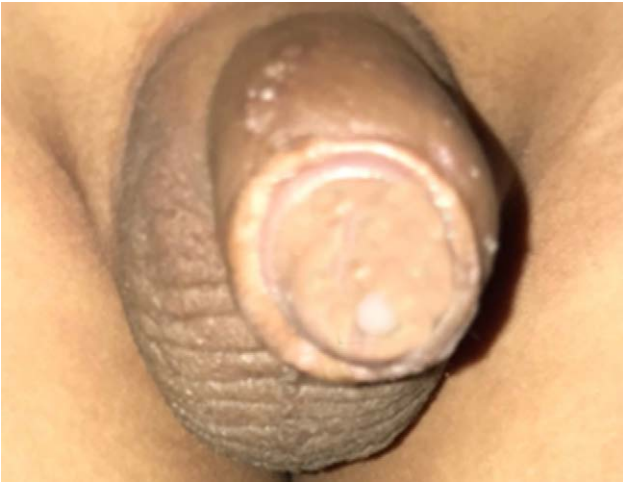
Fig. 1. Preoperative view showing the LC lesion on the penile skin with chylus discharge and chylorrhea from urethral opening; the scrotum showed a normal appearance.