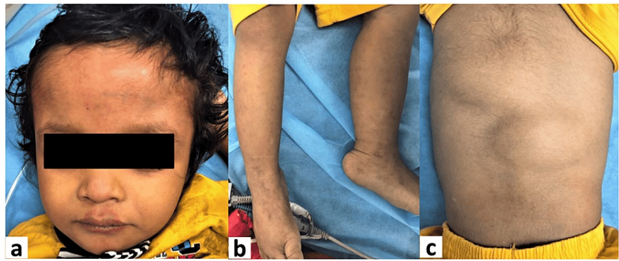
FIGURE 1: shows features seen on clinical examination of the patient

Figure 1 shows the features found on general examination of the patient, macrocephaly with frontal bossing with cutaneous capillary malformations above the upper lip of face (1a), multiple cutaneous capillary malformations over bilateral lower limbs(1b), multiple thick doughy subcutaneous tissues over the back (1c).