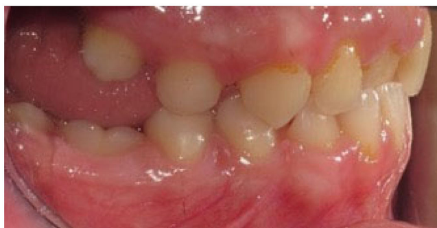
Figure 5. Right photo of the female patient with PFE in bite relationship.