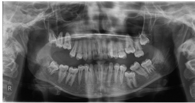
Figure 4. Patient's orthopantomography presenting Primary Failure of Eruption in all four dental quadrants.