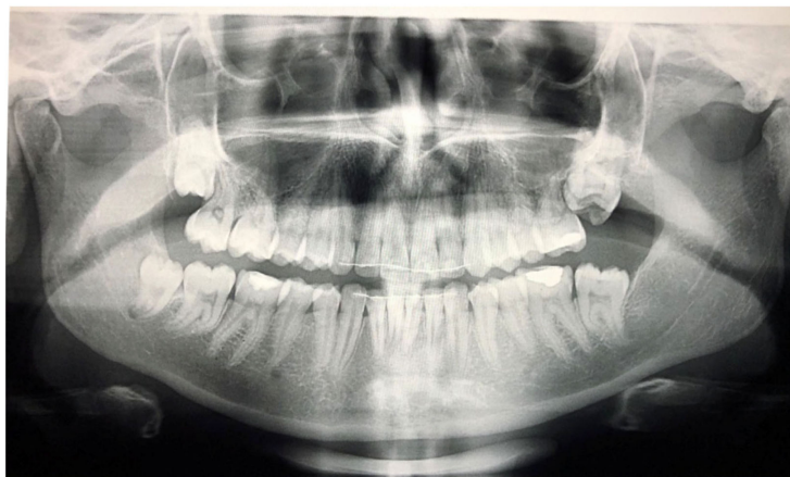
Figure 3. Patient after finishing the orthodontic treatment, presenting secondary retention due to fusion of the upper left second and third molars.

Clinically secondary retention is often assumed when a molar is in infraocclusion at a time period when the tooth should typically be in occlusion. The probability of ankylosis can be recognized via a percussion test and radiographic examination of the periodontal ligament obliteration. Nevertheless, such diagnostic means do not always prove reliable due to the fact that the ankylosed area in secondary retention is usually difficult to observe [12] (Figure 3).