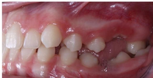
Figure 6. Left photo of the same female patient depicted in Figure 5.