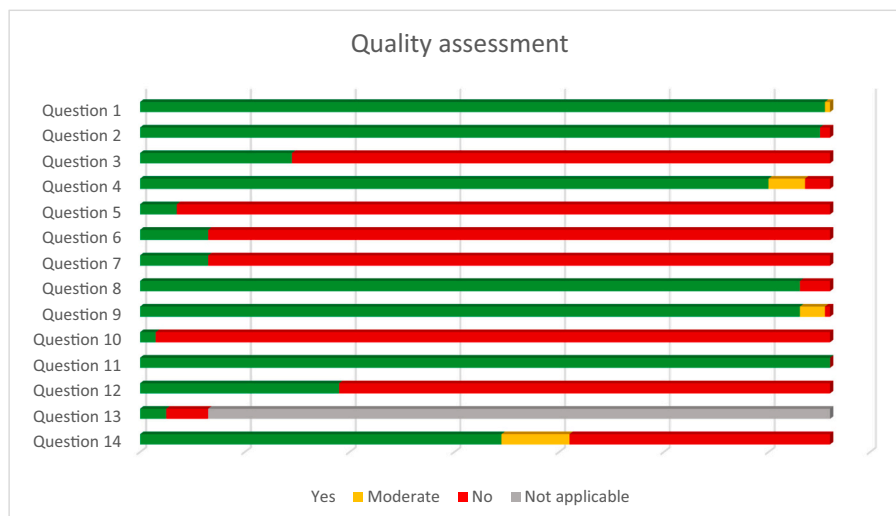
Fig. 3. Quality assessment.

There are several possible explanations for our findings. First, it may well be that the pathophysiology for intimal arterial calcification and medial arterial calcification differs. As stated before, it could be that tunica media calcifications originate from transformation of vascular smooth muscle cells into osteoblast-like cells (Lee et al., 2020). This transformation presumably results because of alterations in the investigated biomarkers of this systematic review. On the other hand, calcifications in the tunica intima seem to be more related to lipid deposits and infiltration of inflammatory cells (Lee et al., 2020). Biomarkers more related to these processes were not part of this systematic review. In most studies the differences between these dominant types of calcifications are not taken into account. Second, many studies have a cross-sectional design which has limitations for etiologic associations. Although we might conclude that the serum markers seem to have no relevant diagnostic value for arterial calcification. Third, the measurement of serum markers and/or arterial calcification varies, as well as the investigated study populations. Fourth, there were quality issues in