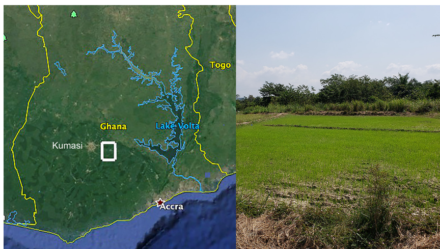
FIG 1 Location and environment of sampling site.

sepsis (1, 2). Recent in silico modeling predicts the global burden of melioidosis, once thought to be a few thousand cases per year, to infect 165,000 people, causing approximately 89,000 deaths (3). Consistent with this prediction, B. pseudomallei continues to emerge as a significant pathogen even 100 years after its discovery in Rangoon, Burma (Yangon, Myanmar), by the pathologist Alfred Whitmore in 1911 (4).