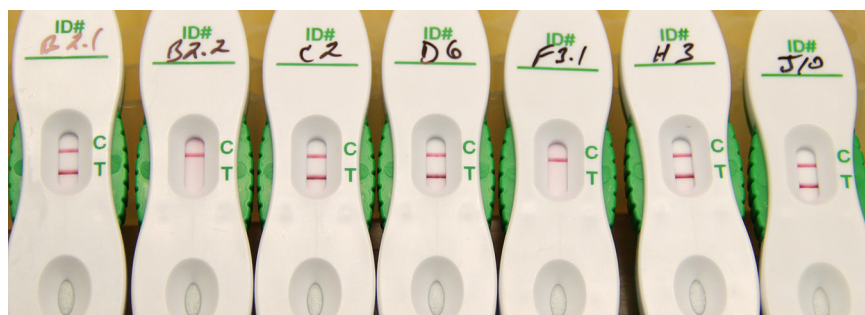
FIG 3 Active Melioidosis Detect lateral flow immunoassay (AMD LFI) results from the five colonies positively identified as B. pseudomallei . Suspected colonies were suspended in sterile saline to a McFarland standard of 0.5, and 25 mL of the suspension was added to the AMD LFI followed by chase buffer. The control line is indicated by "C" and the test line by "T." Samples with a line at both positions are considered positive for B. pseudomallei capsular polysaccharide.

report in the United Kingdom of a returning traveler with a rural environmental exposure history in Ghana (8, 9). The presence of B. pseudomallei was positively confirmed through culture, the expression of B. pseudomallei capsular polysaccharide, biochemical testing, and PCR in five points throughout our sampling site. These five isolates also displayed antibiotic sensitivity profiles that were consistent with B. pseudomallei . In total, 55% of the 100 points sampled produced colonies that were consistent with B. pseudomallei (Fig. 2A) and were positive for B. pseudomallei capsule. While near neighbors such as Burkholderia thailandensis produce similar colony morphologies on Ashdown's agar, and some strains have been shown to produce B. pseudomallei capsular polysaccharide, near-neighbor species lack the ability to utilize erythritol as the sole carbon source and would have been selected against during the enrichment process (13, 15). Nonetheless, the number of sampling points with confirmed B. pseudomallei remains uncertain, and additional characterization of each sampling point would be required to definitively characterize the full distribution of B. pseudomallei across this sampling site.