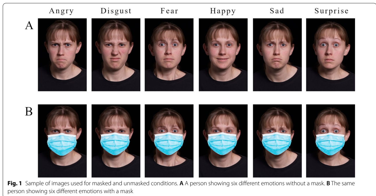
Fig. 1 Sample of images used for masked and unmasked conditions. A A person showing six different emotions without a mask. B The same person showing six different emotions with a mask

Following completion of the RMET, participants completed the Emotion Perception Task. Presentation of the stimuli for the Emotion Perception Task was also randomized between participants. Participants were asked to answer as quickly as possible by selecting the label they felt best represented the emotion expressed. For the Emotion Perception Task, each of the face stimuli was presented with the same six label options: fear, anger, surprise, happy, sad, and disgust. There were 48 total Emotion Perception trials (24 with face masks, 24 without face masks). For each of the emotional expressions, two were presented with face masks, and two without face masks, and for each of those, one female and one male face was presented.