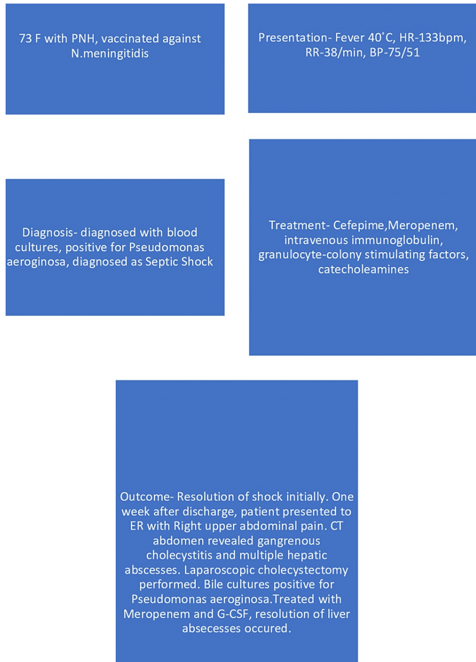
FIGURE 2: Description of Pseudomonas aeruginosa infection

PNH: Paroxysmal Nocturnal Hemoglobinuria; HR: Heart Rate; RR: Respiratory Rate; BP: Blood Pressure; ER: Emergency Room; CT: Computed Tomography; G-CSF: Granulocyte-Colony Stimulating Factor