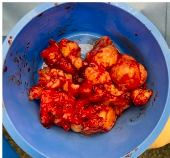
Fig. 3. The whole adenoma after its removal.