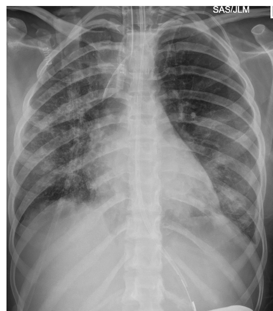
Fig. 1. Frontal chest radiograph shows multifocal airspace and reticular opacities in a patient with Acute Myelogenous Leukemia.

Besides the variability in chemotherapy treatments, concurrent administration of glucocorticoids – often used in cancer treatments – present a confounding variable due to their known immunosuppressive role. Notably, three of the four patients (75%) with severe disease – all of