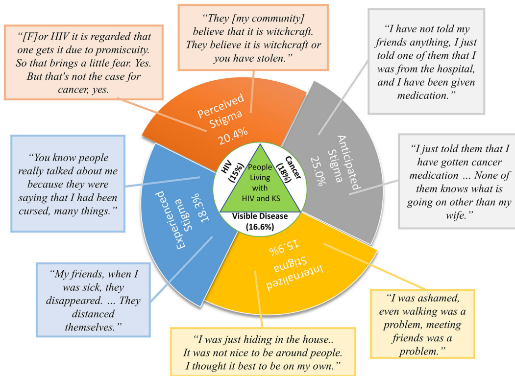
Figure 2. Mixed-methods representation of stigma in HIV-associated Kaposi's sarcoma: manifestations and proportion experiencing moderate or severe overall stigma. Joint display of the manifestations of stigma described by the Health Stigma and Discrimination Framework, with each portion of the pinwheel representing one of the stigma constructs (perceived, anticipated, internalized and experiences) included in the analysis. The quantitative results are represented as the percentage of responses with moderate or severe stigma for each of the constructs. The call outs extending from each of the pinwheels include representative quotes for each construct.

I could vomit so I wasn't taking them as required. (Participant 19, 39-year-old woman, previous HIV diagnosis)