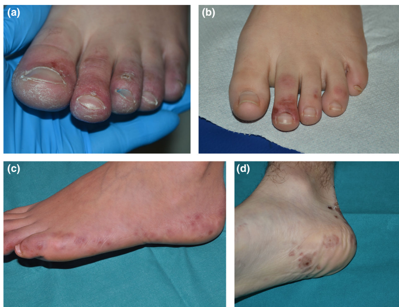
Figure 1 (a–d) The spectrum of acral ischaemic lesions in children in the setting of COVID-19.

The periungual and subungual skin is usually affected. In the subsequent evolution, the lesions may become vesiculobullous or present with dark-purple or black crusts. The plantar region and the lateral aspect of the feet and the heels may also be involved, with coarse, ecchymotic and infiltrated lesions.