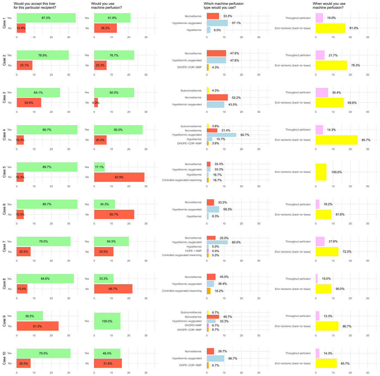
FIGURE 1 Survey answers [Color figure can be viewed at wileyonlinelibrary.com ] [Color figure can be viewed at wileyonlinelibrary.com ]

North America and South America, respectively. Centre volume was \geq 100 , 50-100, and < 50 for 10 (25.6%), 19 (48.7%), and 10 (25.6%) respondents, respectively. Five respondents were from centers without an established MP program.