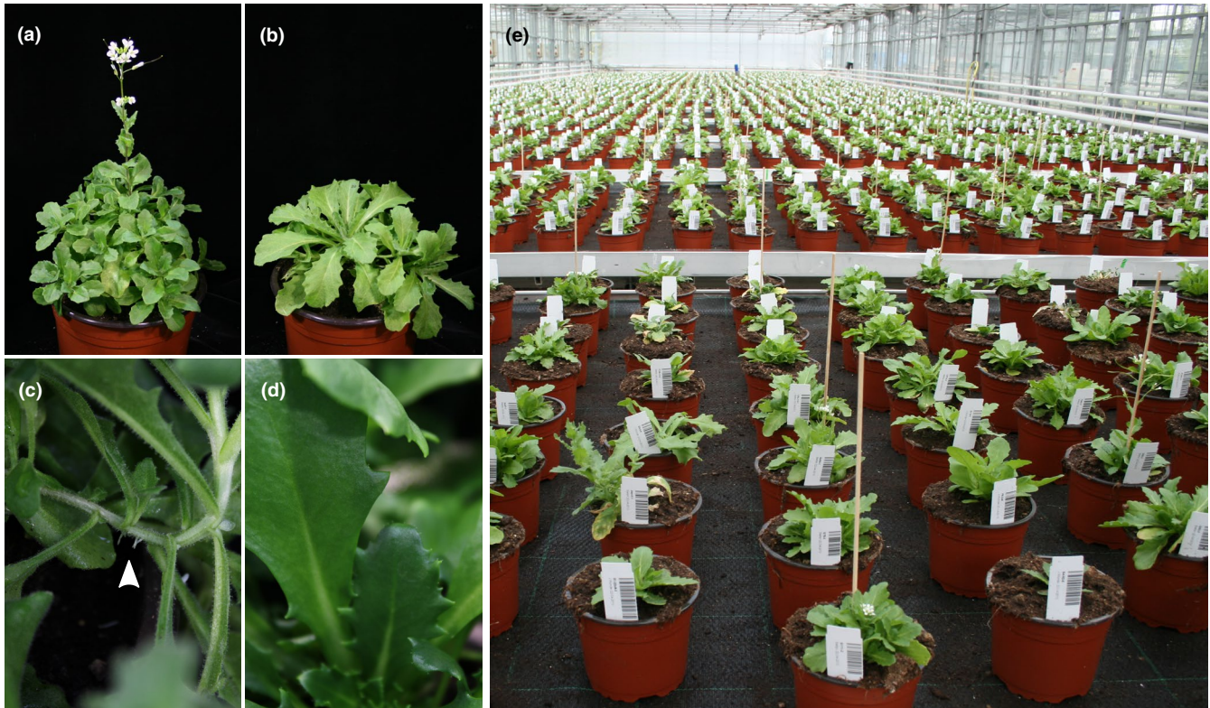
FIGURE 2 Examples of developmental traits studied using Arabis alpina (a–d): flowering time in the glasshouse varies between plants from the same population (a, b), adventitious rooting (arrow) at lateral branches (c), and a naturally occurring variant with low trichome density (d). Illustration of large-scale glasshouse survey testing for naturally occurring variation in developmental traits (e)

integrative approaches including phenologically linked traits will be well suited to investigate the principles of life history divergence.