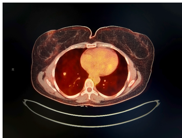
Fig. 2. PET/CT showed interval decrease in size of the right lower lobe nodule now measuring 1.6 cm with SUV max 2.3.

There are no randomized phase III trials that reveal any impact of adjuvant radiation therapy on progression free or overall survival in patients with uterine sarcomas. Reed et al., examined the role of