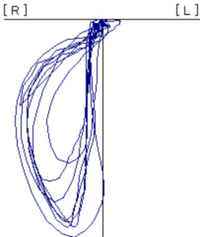
FIGURE 1 The masticatory path pattern at the 5th to 14th cycle

The masticatory path pattern was used as an index of masticatory movement and as an index of masticatory motor skill. The measurement and classification followed the method described by Kobayashi et al. 18 A jaw movement recording device (Motion VISI-TRAINER V-1; GC Corporation) and gummy jelly (GLUCOLUMN; GC Corporation) were used. Participants chewed the gummy jelly for 20 s on their habitual chewing side. The trajectory of jaw movement was recorded three-dimensionally, and the 5th to 14th cycles were ranged using dedicated software. The superimposed pattern (Figure 1) was displayed and classified into seven patterns by Kobayashi et al, 18 which are defined by the characteristics of the path. Seven patterns include six combinations of three types of opening paths (a linear or concave path, a path toward the chewing side after toward the non-working side and a convex path) and two types of closing paths (a convex path and a concave path), plus one crossed pattern of opening and closing paths. Of these patterns, patterns 1 and 3 were considered healthy or normal patterns, whilst five patterns other than 1 and 3 were considered abnormal patterns. 18,20 In this study, participants were divided into two groups according to normal or abnormal mastication patterns.