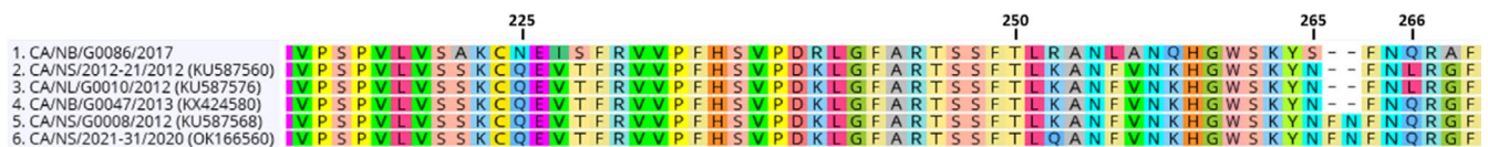
FIGURE 3 ISAV S5 partial amino acid sequences of the HPRO-like under study (#6) and other available variants in Atlantic Canada. Variant #1 is from a EU HPRO variant. Variant #4 is from a NA HPRO variant detected in a hatchery in New Brunswick in 2013. Isolates #2, #3 and #5 are from NA HPR \Delta variants isolated in 2012 from disease outbreaks in open net pens in Newfoundland (#3) and Nova Scotia (#2 and #5). Accessions numbers of corresponding nucleic acid sequence, when available, are indicated between brackets