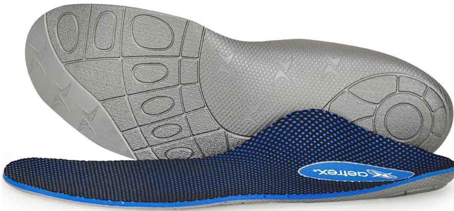
Figure 1 Image of Aetrex L700 Speed Orthotics.

of RRIIs, to help them provide accurate, consistent data relating to the injury.