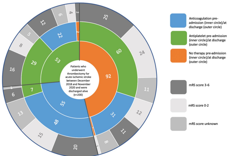
Fig. 3 3-month modified rankin scale score based on pre-admission and discharge antithrombotic use

This study adds to the existing literature on the relationship between pre-admission antithrombotic use and outcome after thrombectomy for ischemic stroke. To date, pre-admission antiplatelet use has been shown to be safe, with no increase in ICH, but with the exception of one study that demonstrated dual antiplatelet use was associated with improved 3-month functional outcome and mortality, most existing data do not suggest pre-admission antiplatelet use impacts functional outcome [11–13]. Pre-admission