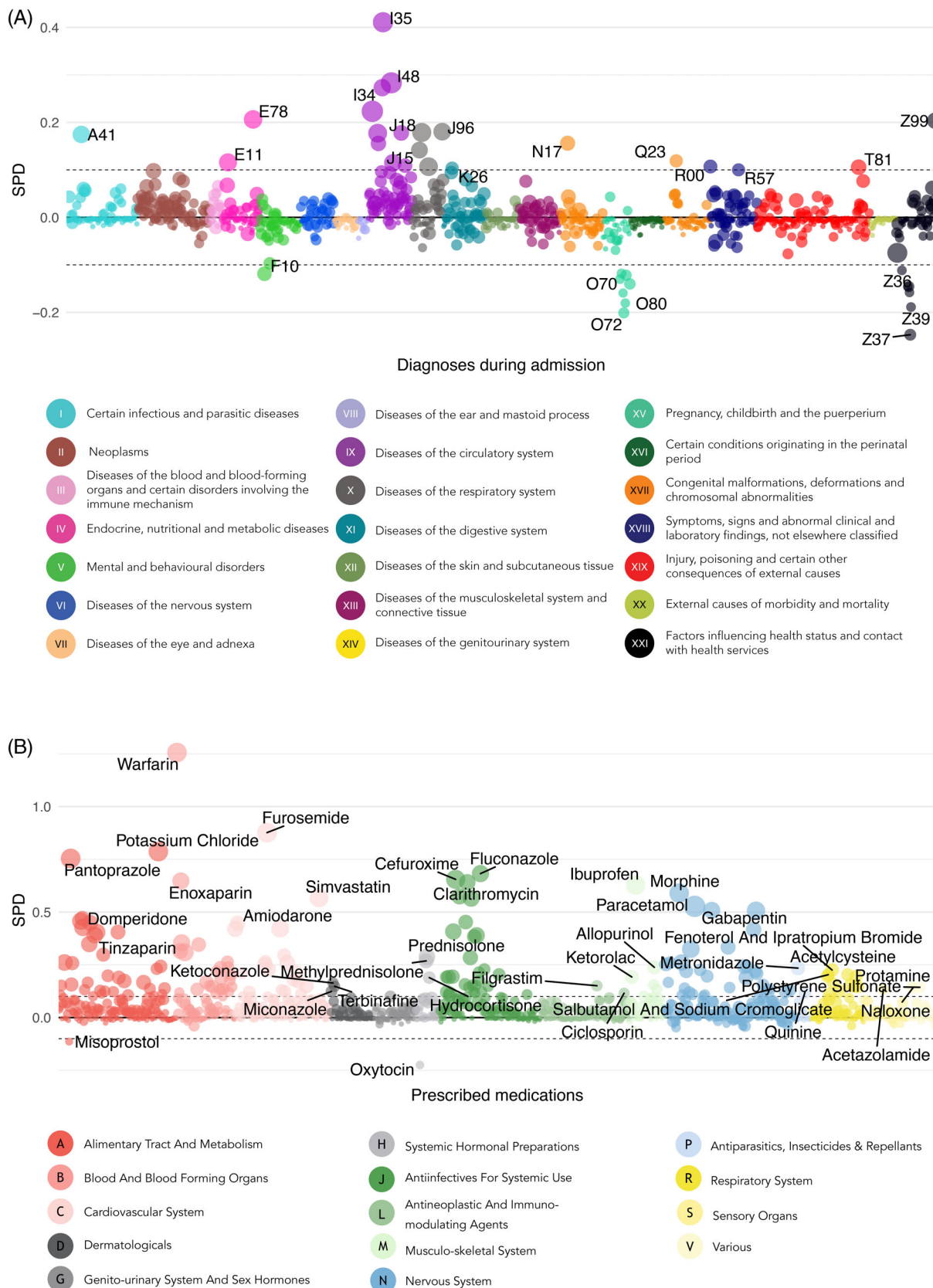
FIGURE 1 Standardised differences in proportions (i.e. discouraged drug pairs initiated versus not) of diagnoses (A) and prescribed drugs during admissions (B), respectively. The colour represents ICD-10 chapter and anatomical ATC level, respectively, and the size is the prevalence in patients exposed to discouraged drug pairs. The top three diagnoses and drugs are labelled