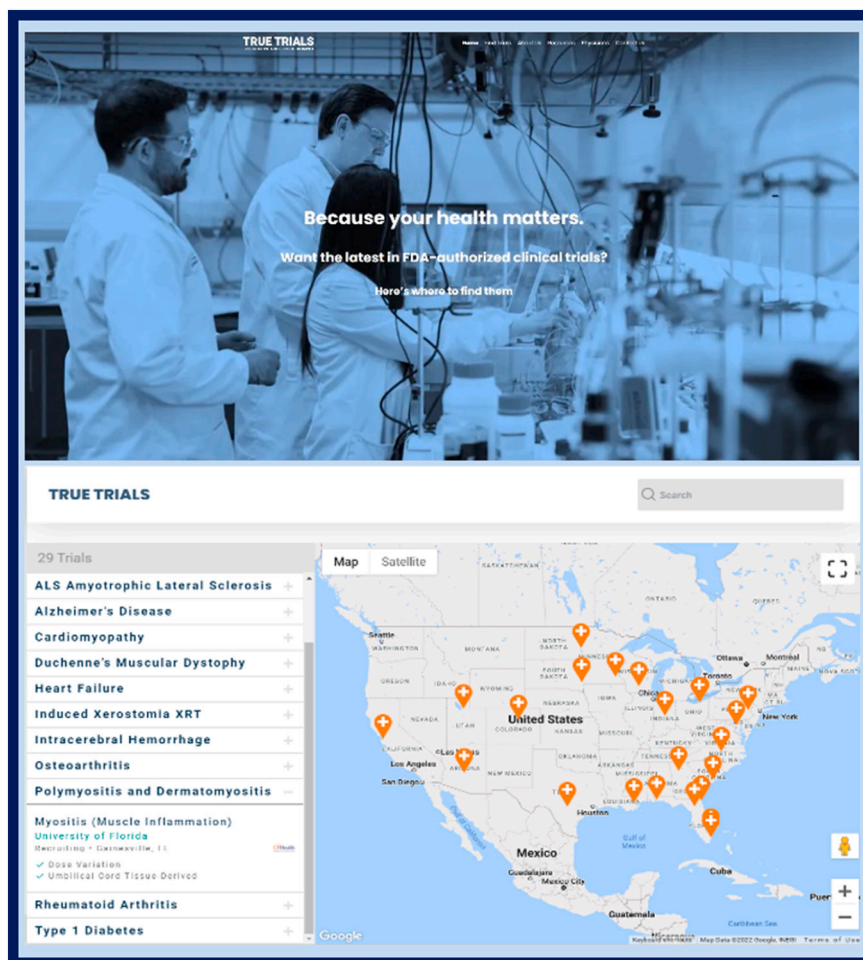
Fig. 2. Excerpt from the development phase of the website for TrueTrials, a 501c3 organization, with the link www.truetrials.org . This website will only list clinical trials authorized by FDA to enroll patients, and provides a patient-directed interface with a searchable table of trials along with a linked map of trial sites, as shown.