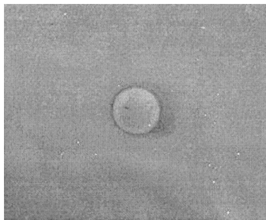
FIG. 2. Induction of the Mar phenotype in SL1344/CFP/ marR . SL1344/CFP/ marR and E. coli strain MC4100pGOB18 (center of plate) were incubated together in the presence of 3.5 mM salicylate.

were treated with 1 mg of pronase E (Sigma) per ml. As shown in Fig. 2, the zone was also absent if SL1344/CFP/ marR or SL1344 was grown in Lennox L broth and incubated on Lennox L agar, both containing 3.5 mM salicylate (Sigma). Salicylate can activate the Mar phenotype by physically binding to MarR (5), thus competitively eliminating the repressor effect of MarR on the mar operon (15). Therefore, it appears that resistance to Mcc24 can occur through the mar response. This is also apparent since the zone was absent for S. enterica serotype Typhimurium strain 8431 (Table 1), a mutant exhibiting a Mar-like phenotype (4). Additionally, the salicylate-mediated induction of Mcc24 resistance was prevented by 0.2%-arabinose-induced episomal expression of MarR from pBAD. That is, repression of marA transcription occurred as a result of