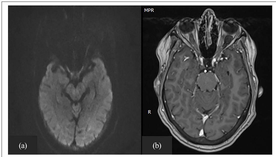
Figure 2. (a) DWI showed no restriction of diffusion in the cystic mass (b) with no enhancement on post-contrast T1-weighted images.

These findings were characteristic of an intraorbital arachnoid cyst, and no further investigation was necessary.