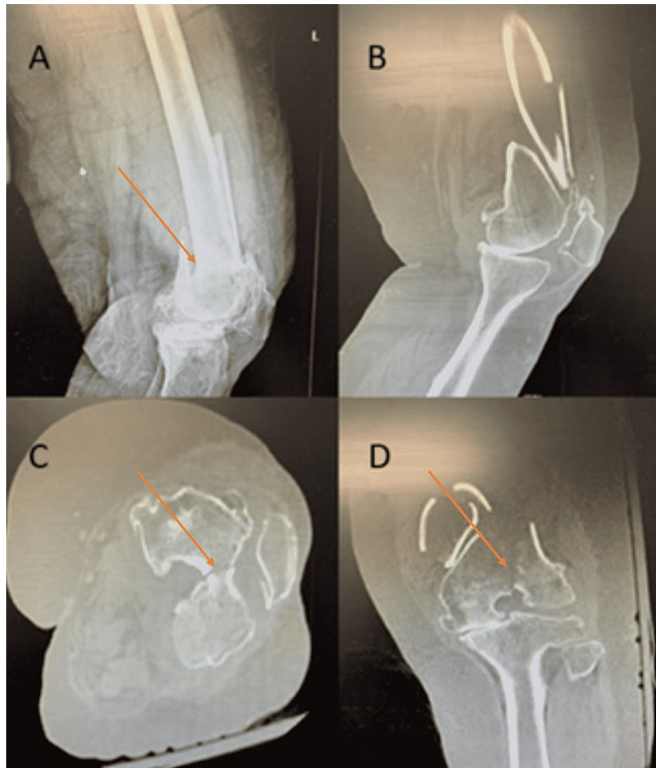
FIGURE 1: Preoperative imaging revealing OTA class C3 fracture of the left distal femur. A: Lateral X-ray of the left knee. B: Lateral CT of the left knee. C: Axial CT of the left knee. D: Coronal CT of the left knee.

A 72-year-old female was admitted to trauma surgery service after a fall from standing, where she sustained a closed displaced left supracondylar distal femur fracture with intercondylar extension with an intact lateral wedge (Orthopedic Trauma Association (OTA) classification C2.1) (Figure 1) [1]. Her past medical comorbidities were extensive, including cardiac valvular disease, hypertension, type II diabetes mellitus, hypothyroidism, acute on chronic blood loss anemia, rheumatoid arthritis, and lupus arthritis, which were treated with anticoagulation and immunosuppressant medications.