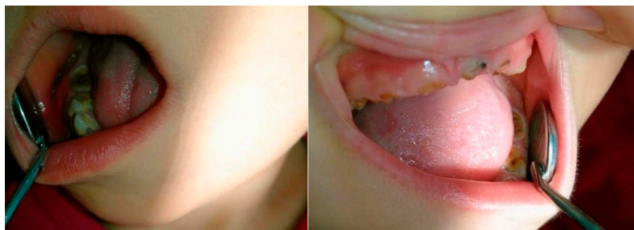
Figure 2. Five years and 7-month year old boy, presenting dmft score 20.

We present one of the most severe clinical cases, 5 years and 7-month year old boy, generally and clinically healthy, presenting, after oral examination, a dmft score of 20 (Figure 2). The carries lesions occur symmetrically along the arches, affecting all deciduous teeth. Due to the lack of treatment and the aggressive evolution of the decay, the crowns for all upper and lower incisors and canines are destroyed. The deciduous molars present on mesial, distal, vestibular, and occlusal surfaces, with multiple caries affecting the undermining marginal enamel ridges.