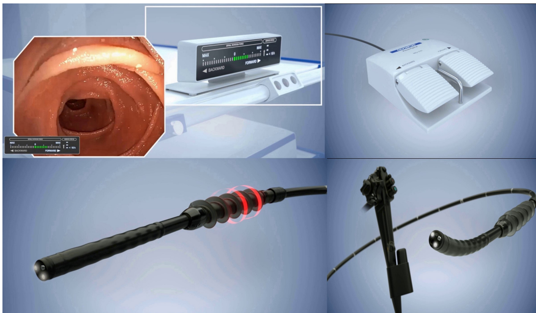
Fig. 2. Motorized spiral enteroscopy system.

The first prospective study of PSE was published by Beyna et al. in 2021. 28 A total of 132 patients with suspected or confirmed small bowel diseases underwent antegrade enteroscopy with PSE at two European tertiary referral endoscopic centers (Dusseldorf, Brussels). The technical success rate of PSE, de-