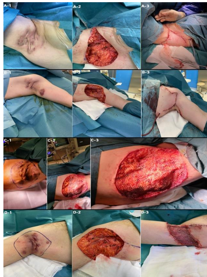
Figure 1. Types of surgical reconstructive techniques used in the surgical treatment of HS. (A) Flap reconstruction: left—HS of right axilla (A-1); center—wide excision (A-2); right—rotatory-flap reconstruction (A-3). (B) Flap reconstruction: left—HS of left axilla (B-1); center—wide excision (B-2); right—bilobed reconstruction (B-3). (C) Split-thickness skin graft: left—HS of left axilla and chest (C-1); center—wide excision and split-thickness skin graft (C-2); right—reconstruction with split-thickness skin graft (C-3). (D) Mixed technique (Flap + STSG): left—HS of right axilla (D-1); center—wide excision (D-2); right—reconstruction with a rotatory flap and split-thickness skin graft (D-3).

We analyzed the demographic and clinical factors that could potentially affect the quality of life of HS patients. Age did not correlate with quality of life but with the time from first symptoms to final diagnosis ( r_s = 0.67 , p < 0.050 ) and the duration of the disease ( r_s = 0.69 , p < 0.050 ). Before the procedure, women and men had similar levels of declared health-related life quality (median \pm QD: 50.00 \pm 15.00 vs. 50.00 \pm 20.00 , respectively) and these differences were not statistically significant ( p = 0.801 ). At the half-year observation, men were characterized by a higher quality of life than women (median \pm QD: 100.00 \pm 7.50 vs. 90.00 \pm 9.50 , respectively), although also in this case, the differences did not reach statistical significance ( p = 0.075 ). This does not change the fact that the improvement in the quality of life observed after the procedure was significant both in women ( p = 0.003 ) and in men ( p = 0.005 ).