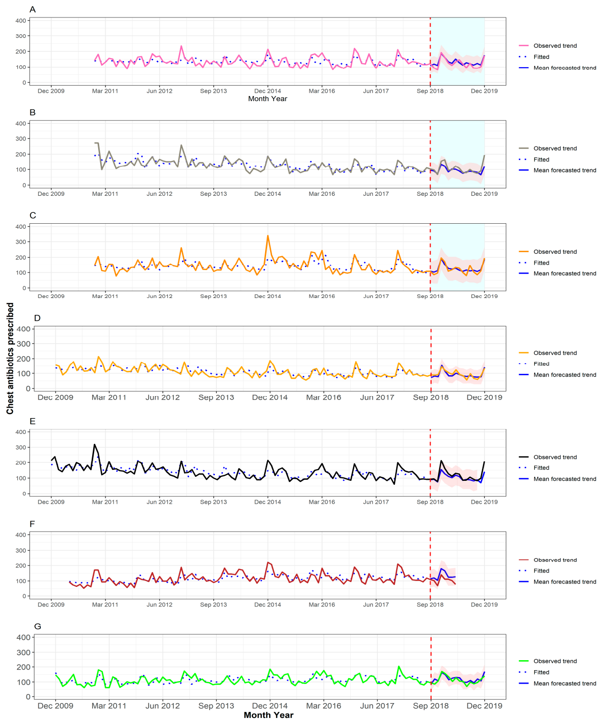
Figure 2. Time series for respiratory-tract-targeted antibiotics prescribed for adult patients across the different OOH primary care locations with CRP machines, (A–C), and those without CRP machines, (D–G). The fitted values obtained from the ARIMA models are depicted using a dotted blue line (pre-September 2018), and the forecasted mean trends are depicted using a solid blue line (post-September 2018), with the corresponding 95% confidence interval highlighted in red.