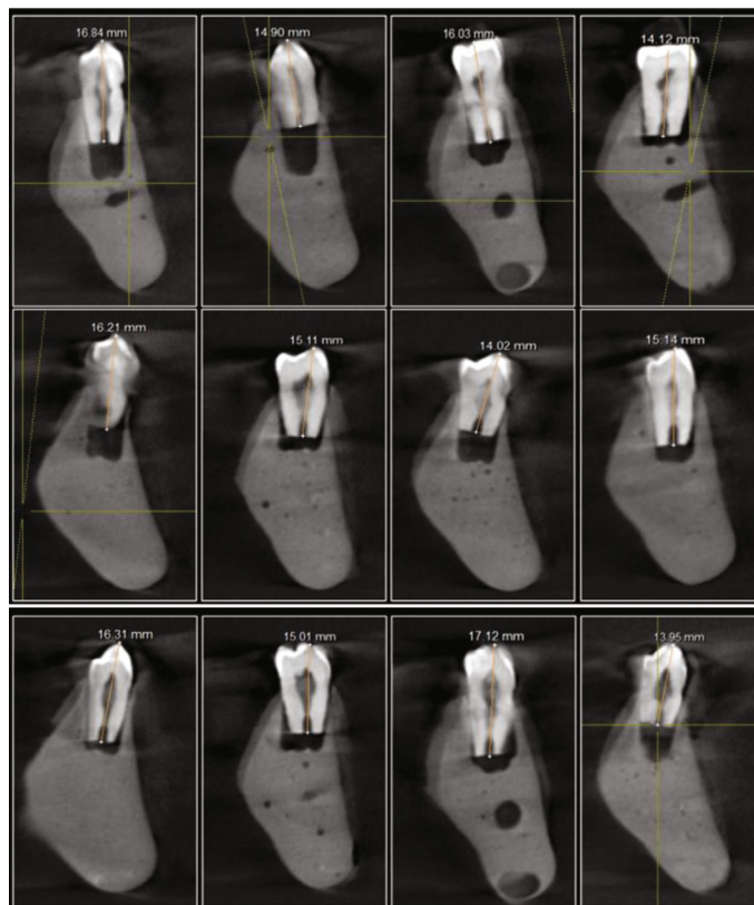
FIGURE 2: WL measurement of mandibular premolars using CBCT imaging (CWL).

results in our study with K file #15 in open apex with Root ZX mini which works with the same functionality and accuracy as Root ZX. Being highly electroconductive, sodium hypochlorite infiltrates into dentinal tubules [18, 19] and allows better electrical contact with the tissues.