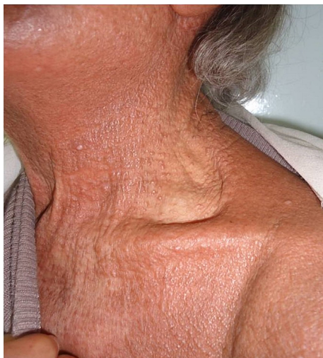
FIGURE 1 Reddened and indurated skin on the neck and on the upper trunk with eruption of lichenoid papules