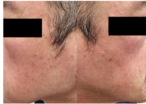
Fig 2. Complete resolution of all clinical symptoms after 8 weeks of treatment with isotretinoin and permethrin cream.

metronidazole gel were discontinued. A trial of low-dose oral isotretinoin 10 mg, 4 times a week (0.1 mg/kg/day) combined with permethrin cream 1% was administered for another 8 weeks. This therapy resulted in marked improvement of the lesions (Fig 2). There was a complete resolution of all clinical symptoms, and repeat SSSB confirmed the eradication of Demodex mites, defined by the consecutive negative results with less than 5 Demodex mites/cm 2 spanning beyond 2 mite-life cycles. The isotretinoin treatment and permethrin cream were continued for 6 months. There was no recurrence at 9 months after isotretinoin administration.