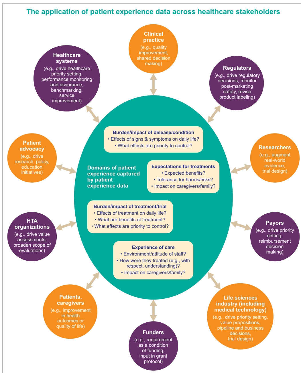
Fig. 1 The collective value of PXD across diverse healthcare stakeholder groups provides opportunities for integration and a patient-engaged approach [19, 21, 22, 37–42]. PXD patient experience data

Leveraging PXD to inform healthcare decision making will benefit the whole healthcare system and help to address current misalignment between what patients need and what they receive. Developing a collaborative approach to defining and collecting PXD would deliver healthcare systems that are focused on improving outcomes that are most meaningful to patients and not only those valued by other stakeholders. For example, it was patient preference data that led to the development of a subcutaneous formulation