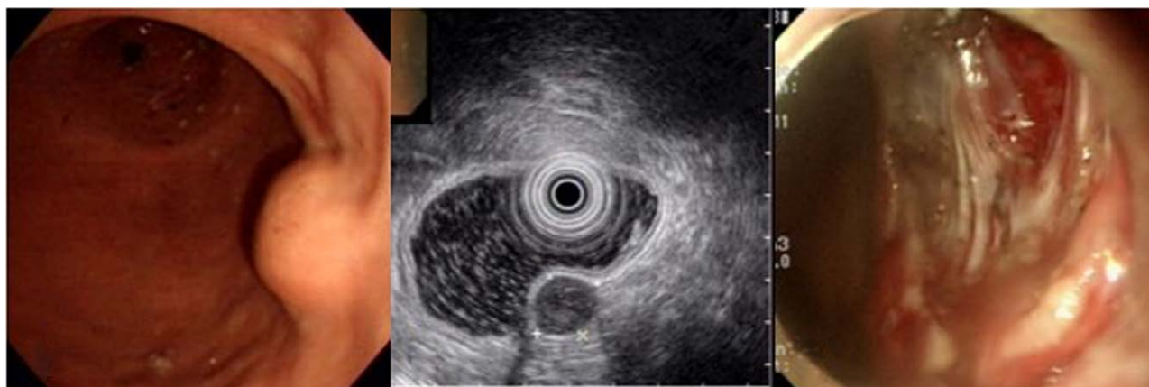
Figure 3. Group III tumor was resected by ESD, EMD, and ESSD. Pathologic diagnosis was GIST. (A) Endoscopic finding. (B) EUS image. (C) Ulceration shows the subserosal layer through defect of the muscularis propria. ESD = endoscopic submucosal dissection, EMD = endoscopic muscular dissection, ESSD = endoscopic subserosal dissection, EUS = endoscopic ultrasounds, GIST = gastrointestinal stromal tumor.