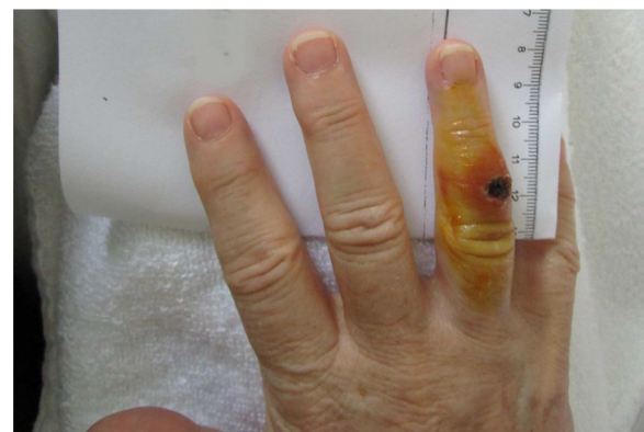
Fig. 1 Picture of the right hand of the patient at day 14 after the squirrel bite on the digit IV. After presentation of the ulcerous lesion and the local lymphadenitis of the right elbow in combination with the non-effective antibiotic treatment using three different antibiotics over 2 weeks, the suspicion of an ulceroglandular tularemia was expressed

In parallel, the wound on the patient's right hand developed an ulcer-like lesion showing swollen reddened edges and a central incrustation (Fig. 1). The lymphadenitis of the right elbow persisted. It was at this stage that tularemia was suspected as a possible diagnosis for the first time. Following a phone call