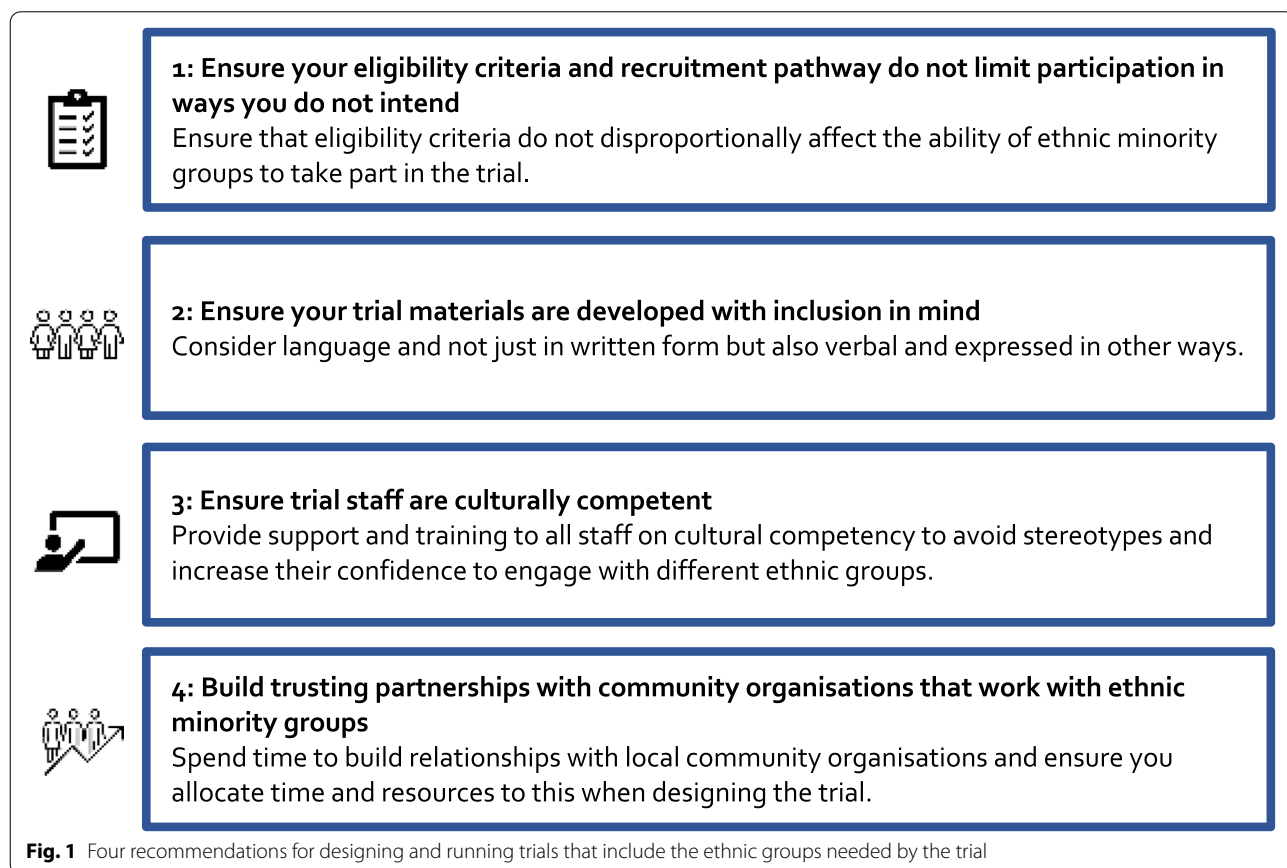
Fig. 1 Four recommendations for designing and running trials that include the ethnic groups needed by the trial

The recruitment pathway itself can introduce challenges to inclusion. Placing recruitment in, say, a hospital clinic makes an assumption that all potential beneficiaries of the trial intervention attend hospital clinics in the same way, which may be far from true. For example, some ethnic groups may be less likely to attend, or be referred to, those clinics, meaning individuals in these groups are, by design, less able to take part in the trial [15–17]. Using UK care homes to support recruitment to falls prevention trials is likely to disproportionately benefit White British people because a larger proportion of older adults from ethnic minorities are cared for in the family home [18]. Although it is beyond trial researchers to improve