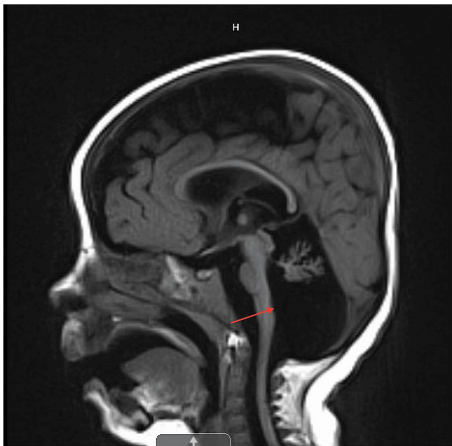
FIGURE 2: T1-blade sag at six months of life. Stable global white matter loss, diminished size of the brainstem, and profound decrease in the cerebellum can be seen with cerebellar disruption, pontocerebellar hypoplasia, and global cerebellar hypoplasia.