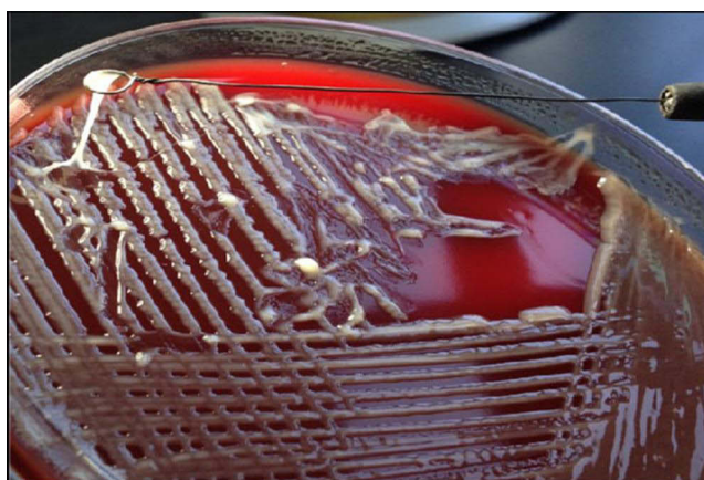
Figure 3 A string test was performed to confirm the hypermucoviscous phenotype of the isolated strain. A viscous string of > 5 mm in length was drawn from the colony, in a positive string test.