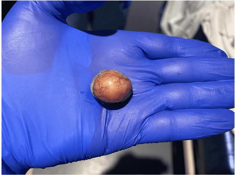
FIGURE 1: Tan-white polypoid soft tissue mass measuring 2.9 x 2.9 x 2.1 cm.

Pathologic analysis showed a well-circumscribed lesion with alternating hypercellular Antoni A with nuclear palisading around fibrillary processes (Verocay bodies) and hypocellular areas (Figure 2). Immunohistochemical staining showed the same profile as the FNAB (Figure 3). Histologic and immunohistochemical profiling supporting the diagnosis of schwannoma.