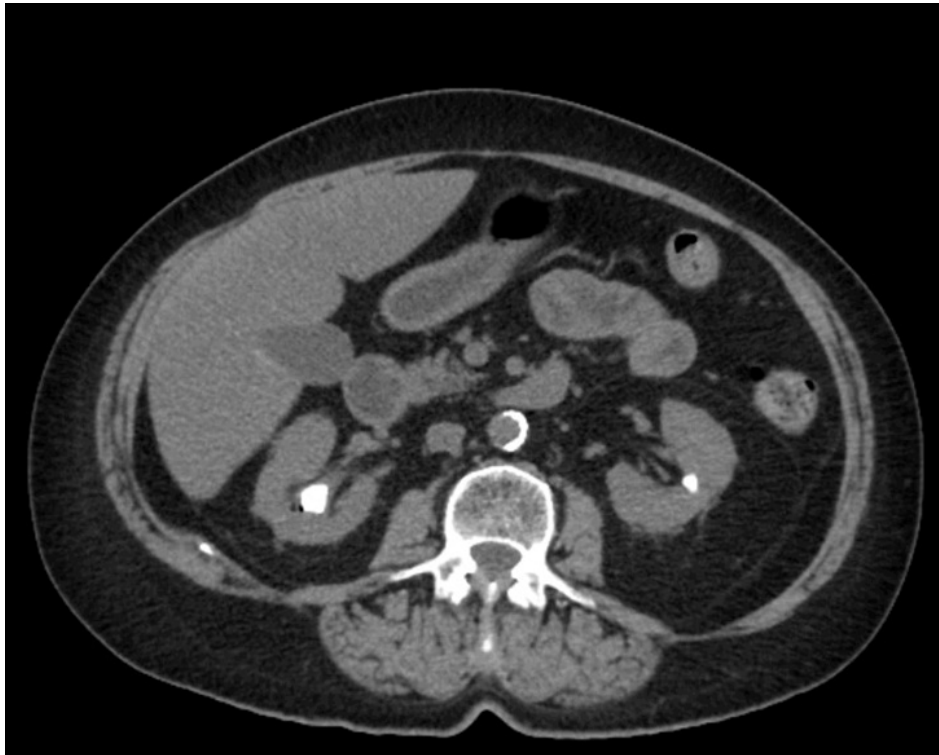
Fig. 2. Abdominal and pelvic CT. The cut showed a 2.8 cm staghorn stone in the upper pole of the right kidney and a 8 mm non-obstructing stone in the interpolar region of the left kidney.