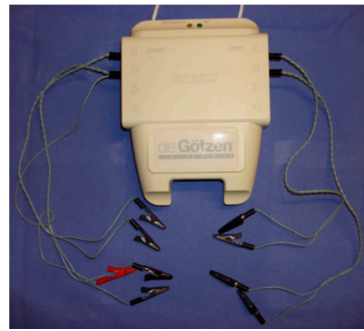
Figure 2. Freely electromyograph (De Gotzen, Legnano, Italy).