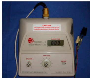
Figure 3. K6-I electromyograph (Myotronics, Tukwila, WA, USA).

Moreover, each subject was examined with a kinesiographic analysis of the mandibular excursion. No patient presenting facial, dental or skeletal pain was included prior to the analysis. The whole flowchart is visually represented in Figure 4.