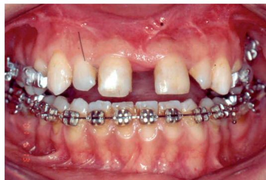
Figure 1. Sarpe activation and fixed therapy initiated in the mandibular arch.

After a latency period of 7 days, patients were instructed to activate the screw by 0.25 mm twice a day as described by Cureton et al. [29]. The patients were monitored once a week until the planned expansion was achieved as suggested by the same author, then the appliance was stabilized with a ligature wire. Active orthodontic treatment was initiated prior to SARPE in the mandibular arch (Figure 1).